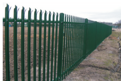
Palisade fencing at Ellington Allotments