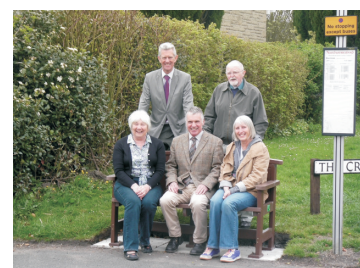
Village seating at Ulgham